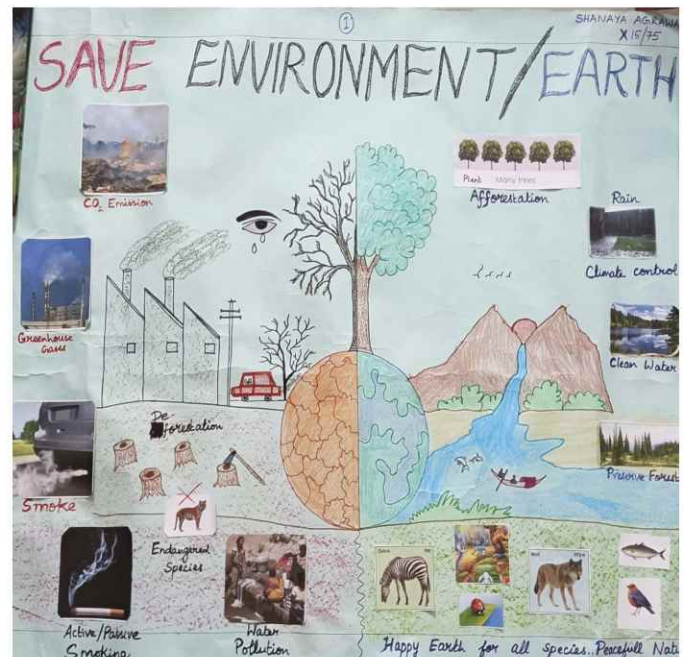
ENVIRONMENT DRAWING MS. SHANAYA AGRAWAL (6 YRS OLD) X 15/75, DAFFODIL HIGHS